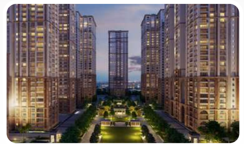
MY HOME SMART CITY

Plot No: 381, Varun Motors, (TRUE VALUE) back side B.N. Reddy Nagar, Vanasthalipuram, Hyderabad - 500070.