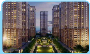
MY HOME SMART CITY