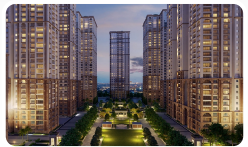
MY HOME SMART CITY

Plot No: 381, Varun Motors, (TRUE VALUE) back side B.N. Reddy Nagar, Vanasthalipuram, Hyderabad - 500070.